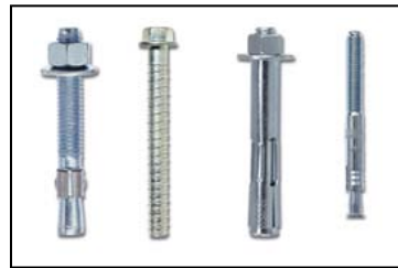
Alternate Engineered Anchor Bolts